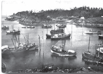
Richardson Fishing Season