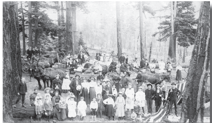
Lopez Hill, 1897