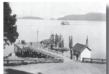
Lopez Ferry Landing c. 1925

We have a great selection of photos to choose from.