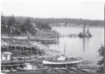
Barlow Bay 1