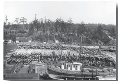
Barlow Bay 2