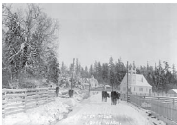
Winter in Lopez Village

You may order Historic Lopez notecards by calling the museum.