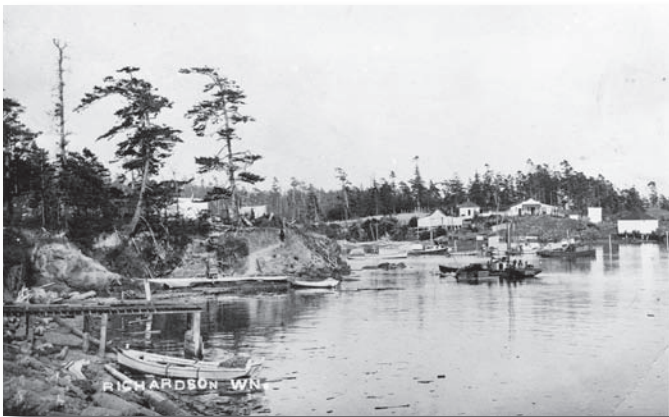
Pre-1912 view of Richardson. Buildings in distance include: barn for Rita and Gertrude Hodgson's horse, Prince. Next, Hodgson's house, the Hodgson-Graham store and slaughterhouse.